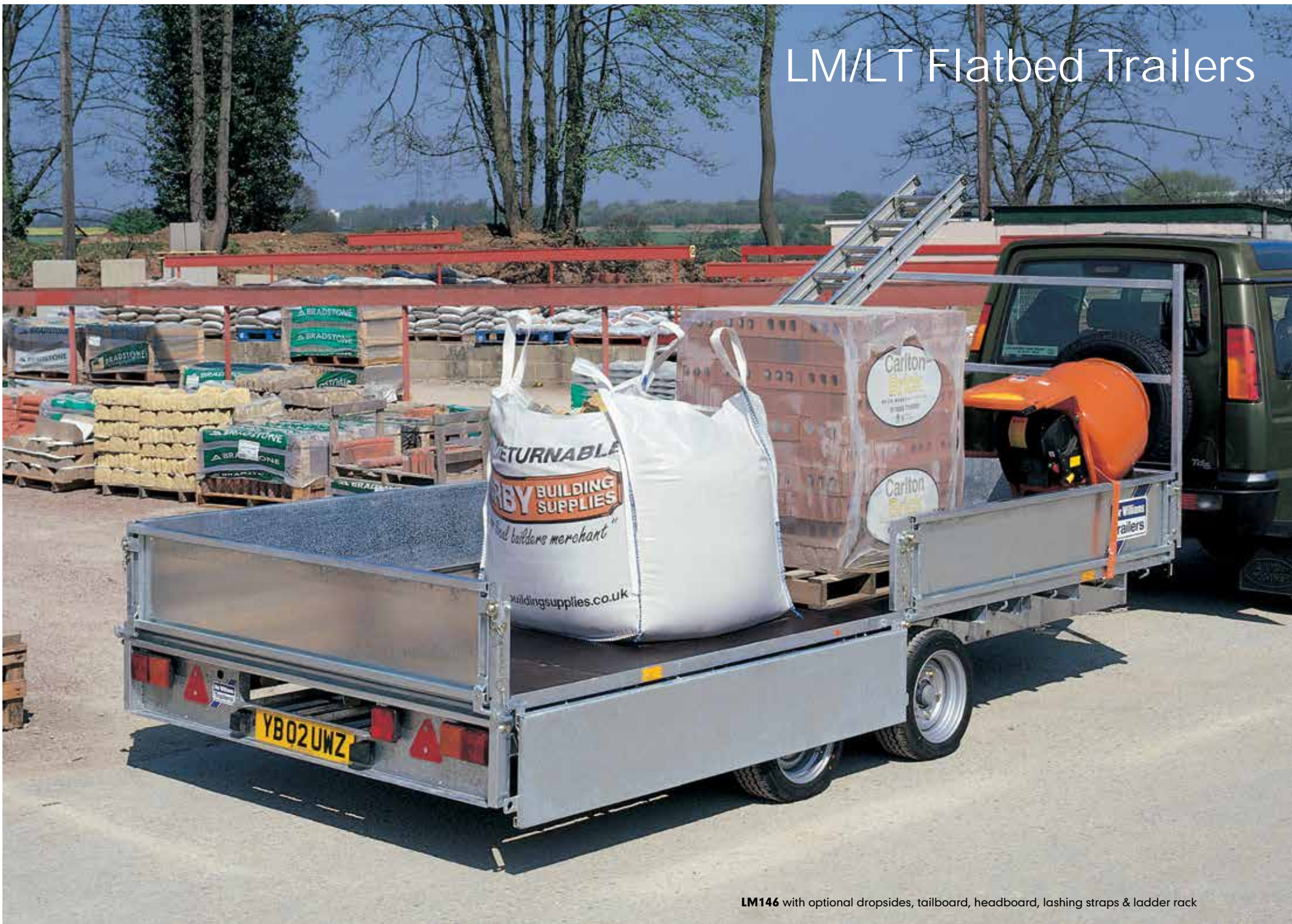
LM146 with optional dropsides, tailboard, headboard, lashing straps & ladder rack