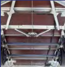
Chassis & Floor

It's the attention to detail of Ifor Williams trailers that makes our products so popular with owners. Just take a look at these standard features.