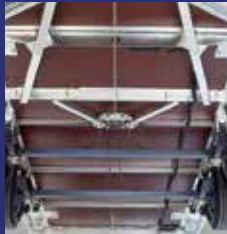
Chassis & Floor

It's the attention to detail of Ifor Williams trailers that makes our products so popular with owners. Just take a look at these standard features.