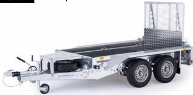
GX84 with ramp