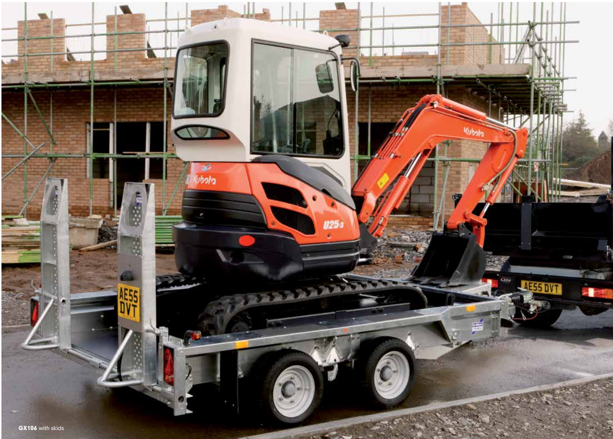
GX106 with skids