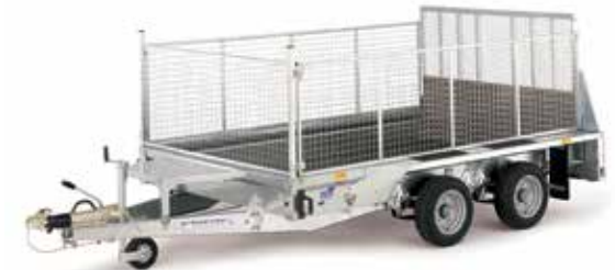
GX range is available with meshsides (ramp model only)

All our plant models are fitted with integrated ramp and skid supports. This standard feature ensures trailers are supported whilst being loaded without the need to deploy prop stands.